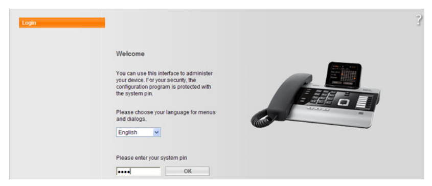
Figure 1 Start screen

Once you have successfully established the connection, the Login Web page is displayed in the Web browser.