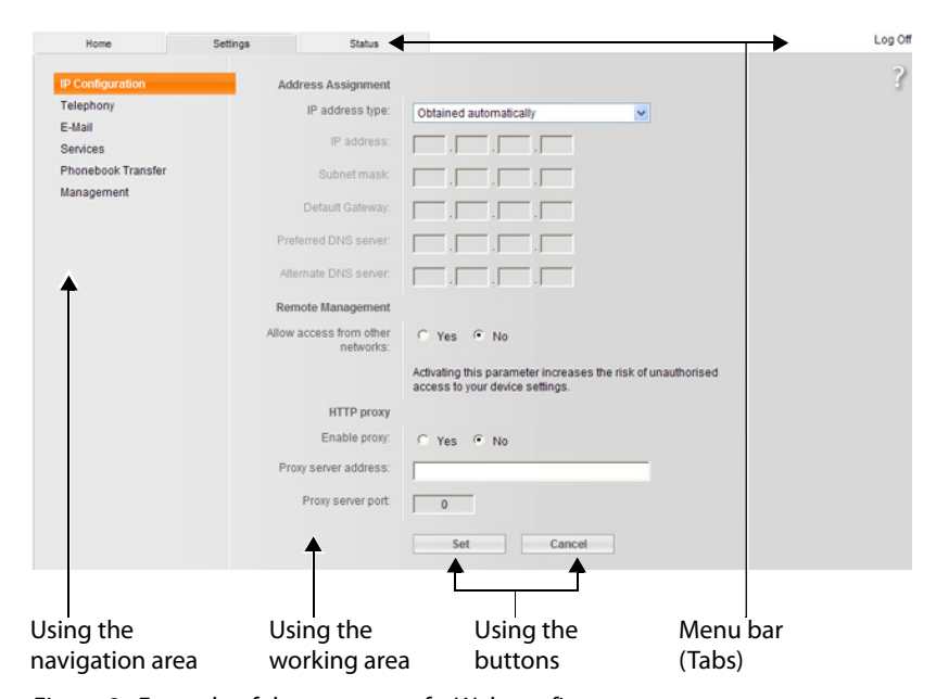
Figure 2 Example of the structure of a Web configurator page

The Web configurator pages (Web pages) contain the UI elements shown in Figure 2 (example).